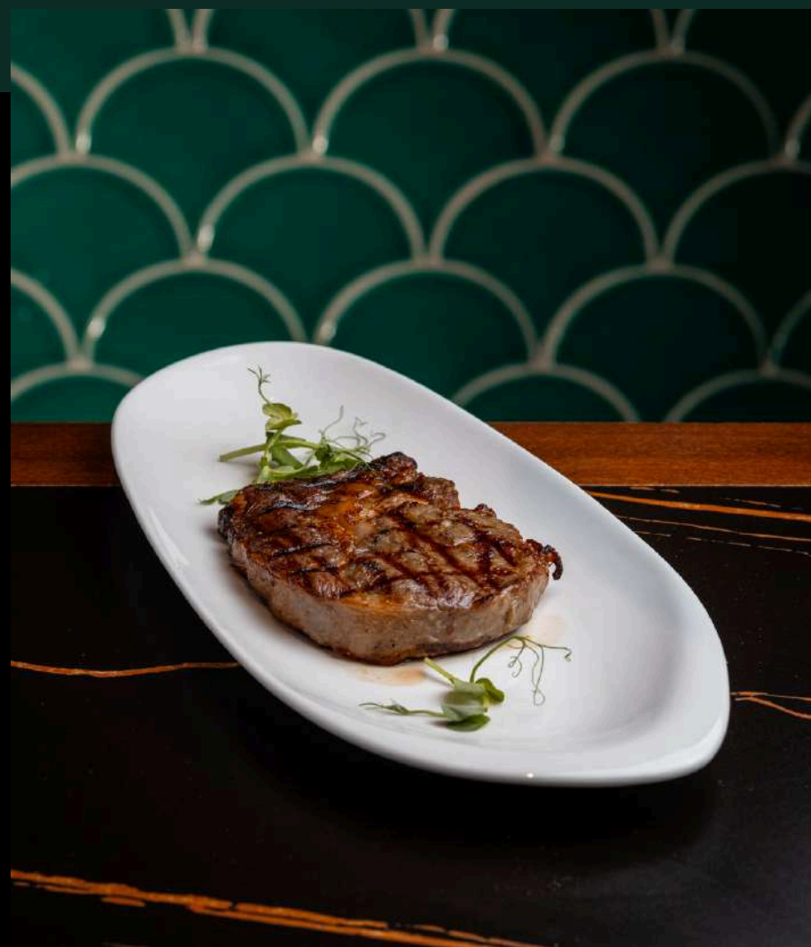
MEDITERRANEAN SET MENU