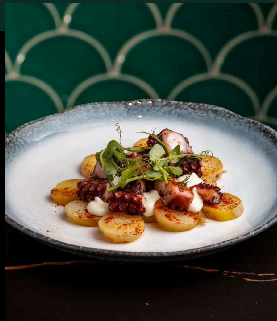
MEDITERRANEAN SET MENU