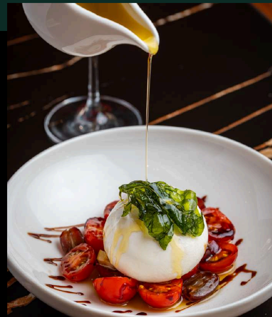
SHARING SET MENU